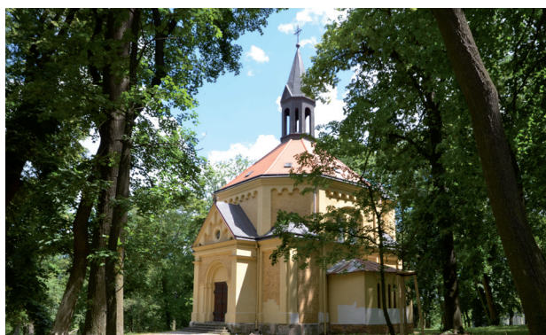
The Chapel of St. Roch.

A sandstone sculpture from 2007 represents a 70,000-time enlargement of wine yeast. It is registered in the Czech Book of Records as the biggest enlargement of a living organism.