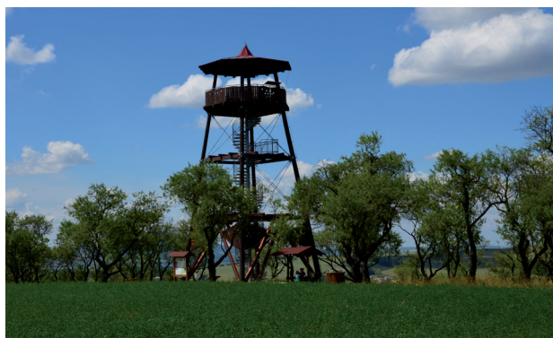
Almond orchards and the lookout tower.